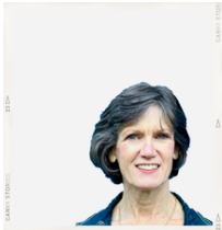
Zena Consulting Founder / Owner