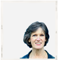
Zena Consulting Founder / Owner

Last month I presented a seminar on "Making a Case for Small & Rural DEI in Today's Multicultural Funding Environment", at the Nonprofit Leaders Conference for Coastal & SW Washington (NPLC).