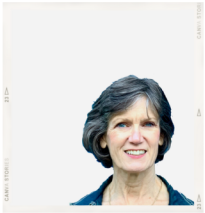
Zena Consulting Founder / Owner

Many organizations celebrate LGBTQ pride this month. Officially recognized since 1999, it's also an opportunity to commemorate events that launched the gay liberation movement, starting with the 1969 Stonewall riots. Generations since have advanced 'Queer rights' through new social issues; from the '80's AIDS crisis, to legalizing gay marriage in 2004, to transgender awareness now.